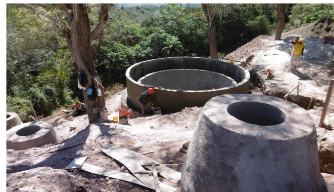
Construction of the Jucuaran water treatment plant in El Salvador

40 decentralised cooperation projects in 28 countries